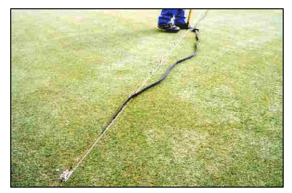
Run string line and cut a slit in turf

Note: ensure that the cable is buried deep enough to avoid damage during maintenance.