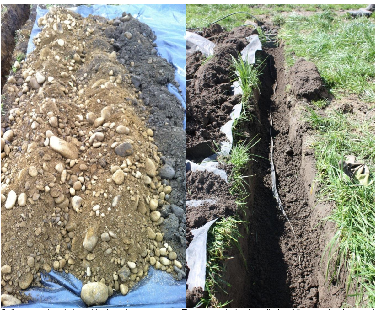
Soil removed and placed in three layers.