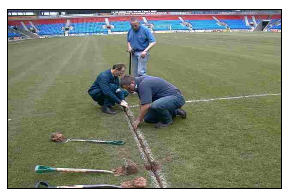
Push sensor to desired depth